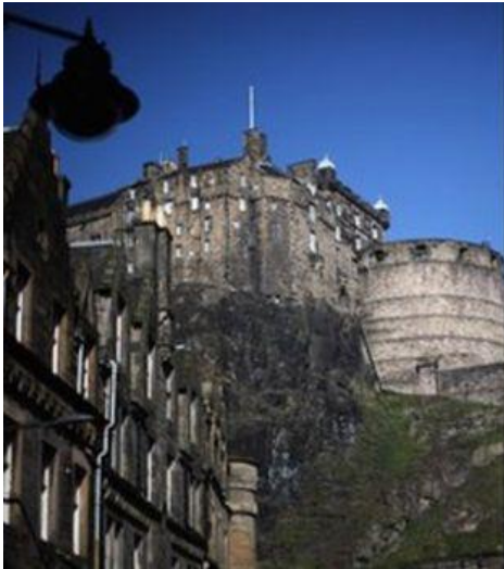
53. Edinburgh (castle)