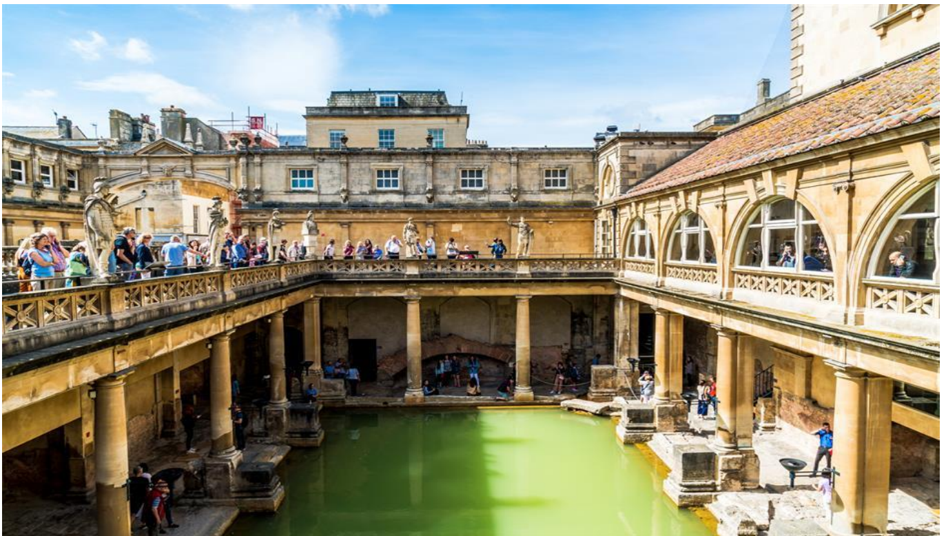
56. Roman Baths in Bath