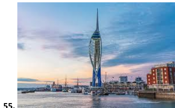
55. Spinnaker Tower in Portsmouth